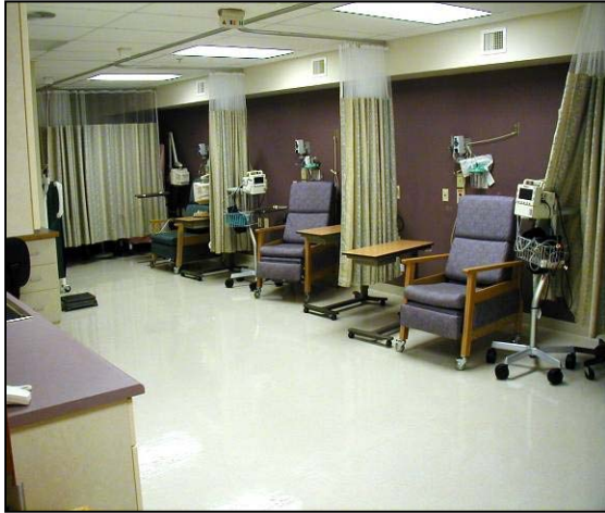
Outpatient Service area

A multitude of services are offered on an outpatient basis at Kimball Health Services. In-house services include adenosine stress tests, cardiac stress tests, EGDs, colonoscopy, IV therapy, same day surgery, sleep studies, etc.